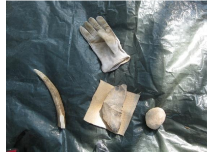
Flint knapping tools