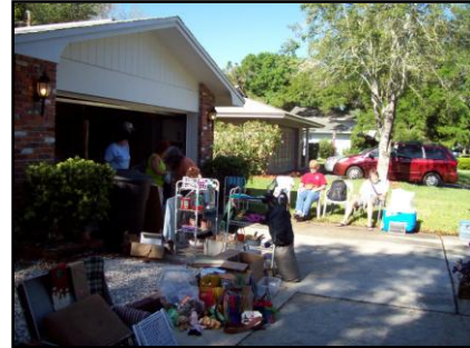
Some of the many items offered at the garage sale