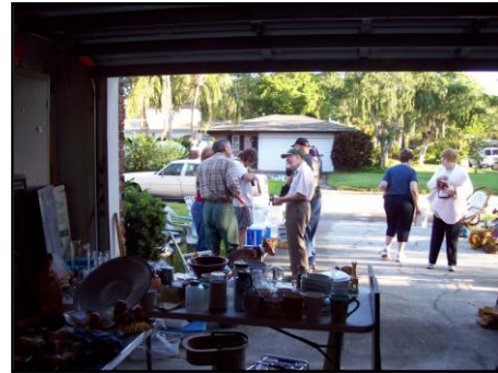
Some of the many visitors that made the garage sale a success