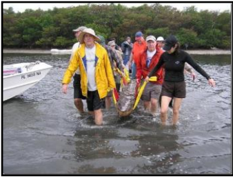
Top: Carrying a section of the canoe to the waiting boat. Right: Canoe sections in the preservation tank.

Once back at Weedon Island, the canoe was cleaned off with fresh water and then placed in a specially made preservation tank. It has gone through several rinses to eliminate salt water and dead organisms. Polyethylene Glycol (PEG) will be slowly added over the next two years to remove the water and make the canoe stable for reconstruction and display. The canoe condition is being monitored on a regular basis to help maintain the stability of the wood. Samples of the wood have been taken to determine which species of pine was used in the canoe's construction and samples of the peat that the canoe was resting on were collected for identification and possible radiocarbon dating conservation and preservation of the canoe is being overseen, by the Alliance for Weedon Island Archaeological Research and Education, Inc. (AWIARE) and members of CGCAS including Chris Hunt, Bob Austin, Phyllis Kolianos, and Dave Burns. Funds for the excavation and preservation of the canoe are being provided by the Friends of Weedon Island.