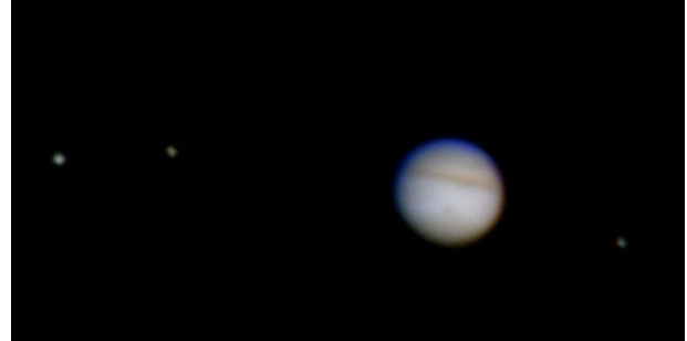
"Moons of Jupiter first seen by Galileo"

A related technology is the MRI scan that uses intense magnetic fields and radio waves to detect hydrogen atoms and digital processing to form high contrast images of soft tissues missed by x-rays. Magnetic Resonance Imaging is also far beyond the scope of this scribble but it may show chemical details of fossils and artifacts that x-rays and dissection cannot see.