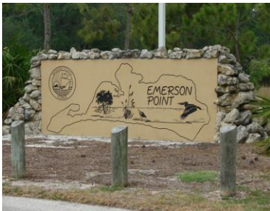
The welcoming sign to Emerson Point Park