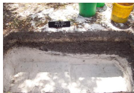
Figure 1 South Wall Profile TU3

We are currently excavating Test Unit 3. We have uncovered a possible pit or low area filled with midden material. The midden sits on white sand and thickens to the west. A column sample was taken on the south wall for analysis. We obtained permission from the owner to extend TU 3 to the south by excavating another 1X2 unit. This will hopefully give us a better picture of the midden's extent.